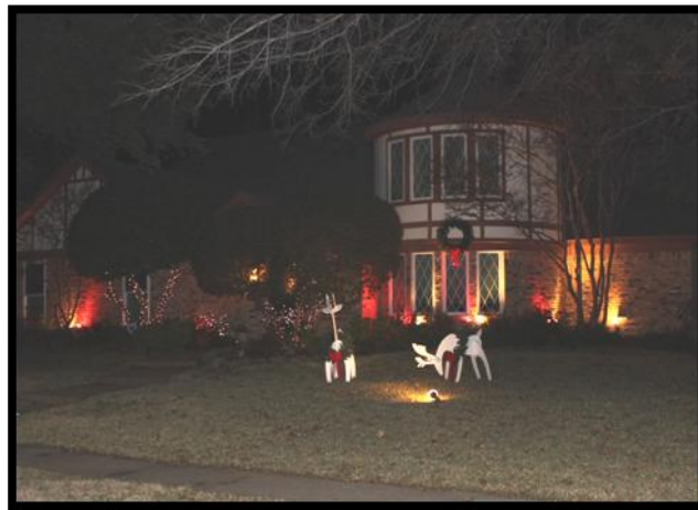
2 nd Place, Perry on Canoncita